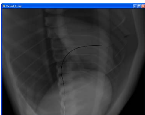
Figure 2. The Virtual X-ray monitor